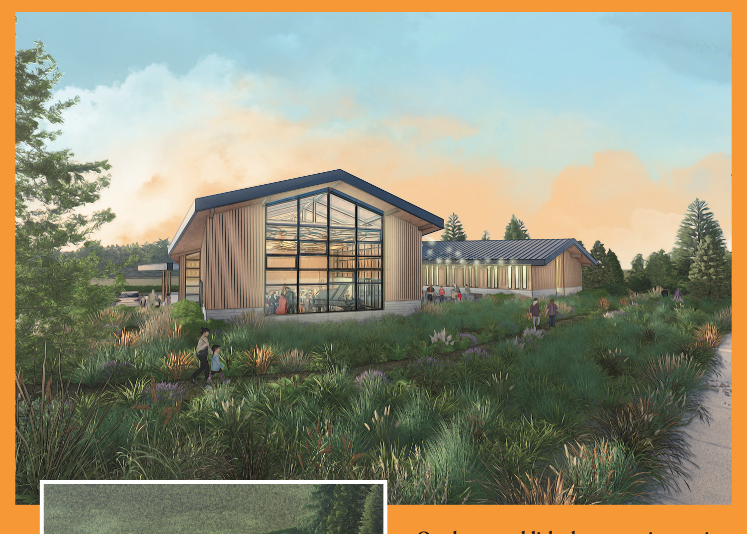
Learn more at:

Support the capital campaign to build a new music school in 2023.