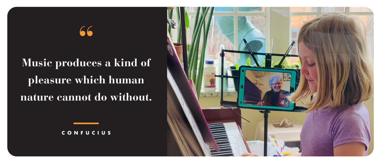
On-line class offers children the opportunity to participate and enjoy all aspects of music during the 2020 pandemic.

warm and welcoming environment of the little Victorian on Spokane Avenue with the sign out front, The North Valley Music School.