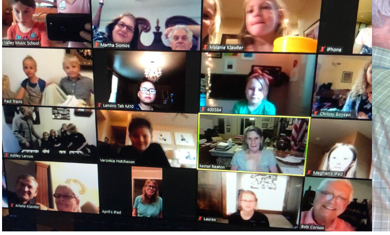
Hi, Ho the Derro, a zooming we will go...