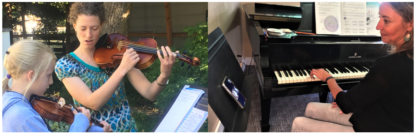
Outdoor learning provides greater access to live instructors, in a safe environment.

Disclaimer: NVMS strives to accurately recognize and thank its generous contributors. If you discover an error in your listing or omission, please accept our apologies and kindly contact us to correct the error. Contact Deidre Corson at deidre@northvalleymusicschool.org or by calling 406-862-8074.