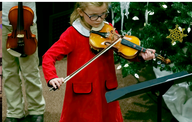
Performing at the Whitefish Christmas Stroll