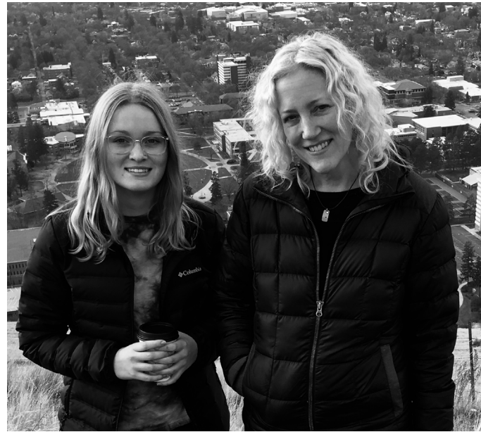
Tina with her daughter

Some of my first students are in their last years of high school now, taking their music skills in turn and sharing with the community via school ensembles or through their own projects. One of the very best parts of my job is watching students grow as musicians, from their joy in learning their first pieces to the realization that music is a valued and creative outlet in their lives. As a community-centered easy walk after school, NVMS is a place where students can explore many different instruments as well as different styles within an instrument. As a performing musician who appreciates creative collaboration with other musicians, I've found that I enjoy helping students explore piano and find what inspires them - classical or pop styles, composition, vocal accompaniment, etc. NVMS has a diversity of musical resources, lessons, classes and ensembles available under the same roof to all ages in the community, from toddlers to seniors, and I always love hearing the sounds of music learning coming from every room.