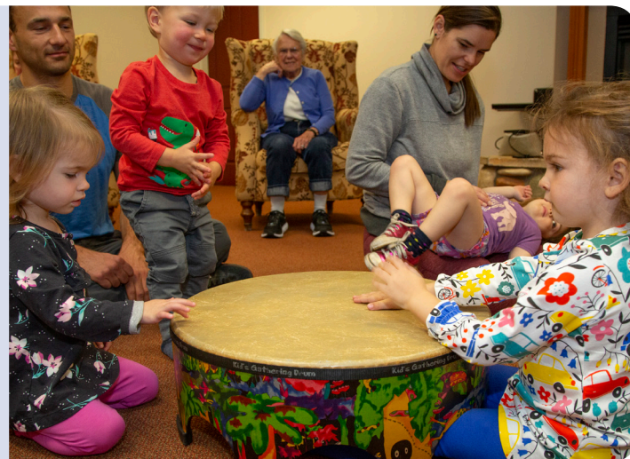
Music Together class offers children the opportunity to participate and enjoy the elements of music in a fun group setting.

Playing music makes you happy. McMaster University discovered that babies who took interactive music classes displayed better early communication skills. They also smiled more.