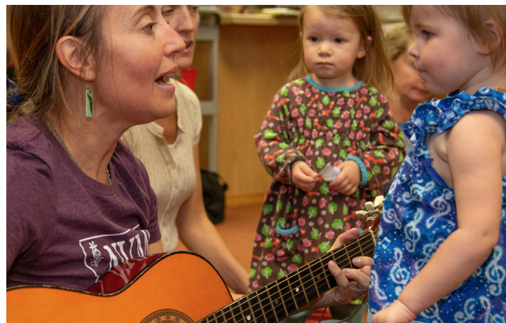
Music Together at The Springs at Whitefish, assisted living facility