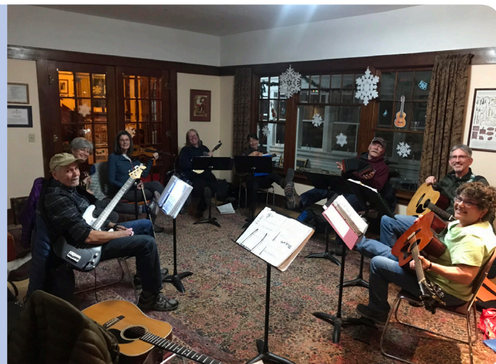
Open Jam night at the school. Learn how to play music with others, how to read chord charts, take a lead, or just play along in a safe and supportive environment.

Studies have found that musical training increases the blood flow to the left hemisphere of the brain. That can be helpful when you need a burst of energy. Skip the energy drink and jam for 30 minutes.