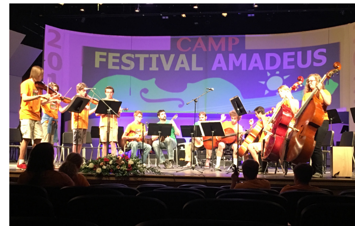
Camp Festival Amadeus performance