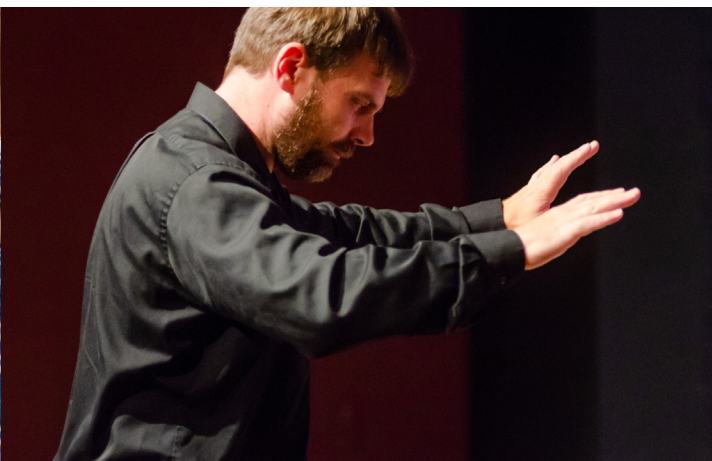
The dedicated faculty at NVMS continue to inspire a new generation of musicians.